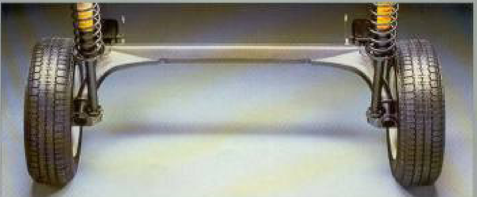
Linked trailing-arm rear suspension