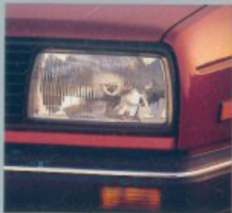
Eurostyle aerodynamic headlights help lower Jetta's drag coefficient to 0.36.